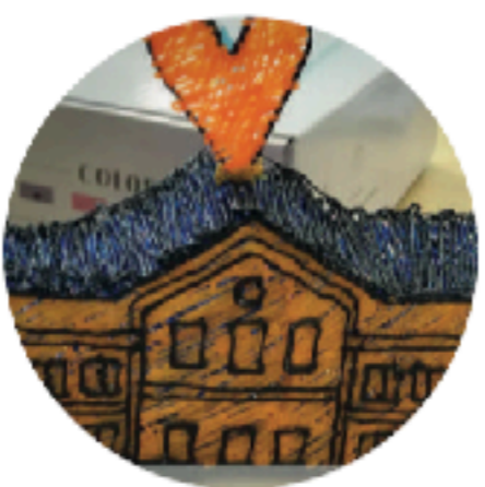
3D GOOGLE DOODLE