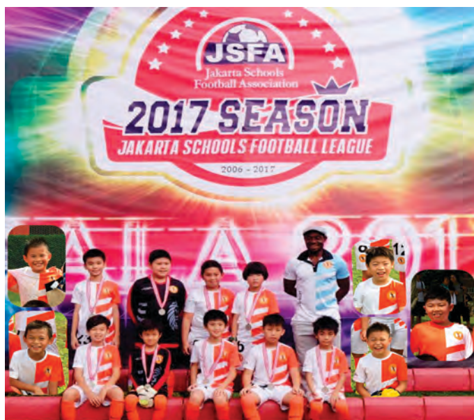
Coca Cola League 2017_ 2nd place U10B