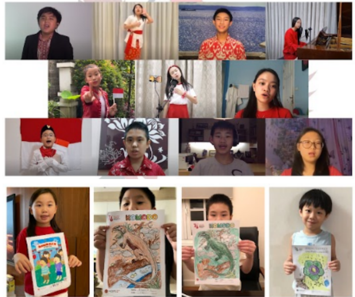
Last year NH Virtual Celebration of Independence Day