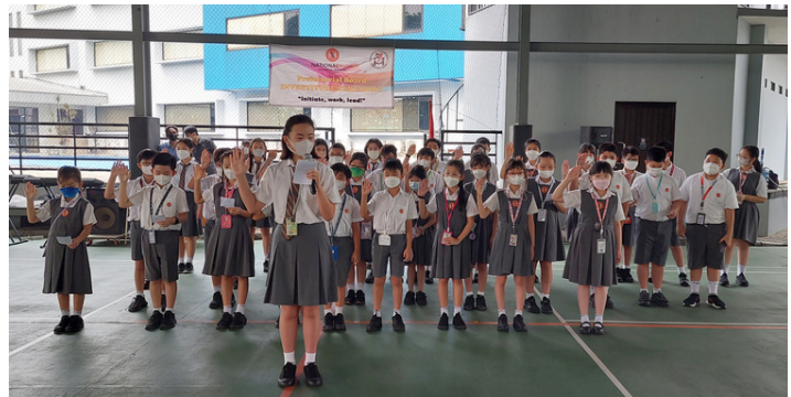
Our young leaders taking their oath.

On Monday, 5 September 2022, selected students from Years 3 to 7 stood confidently in front of students and faculty. These young individuals who will take on challenging yet fulfilling roles and responsibilities this school year are our inspired and passionate officers and members of NationalHigh's Prefectorial Board.