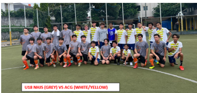
U18 NHJS (GREY) VS ACG (WHITE/YELLOW)

Although neither team managed a win, it was overall a very good start for all players. Both teams are keeping their spirits high and are motivated to keep up with trainings and prepare for the next friendly match or competition.