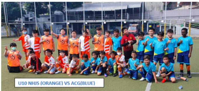
U10 NHJS (ORANGE) VS ACG(BLUE)