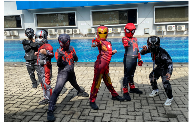
Heroes vs Villains Friday

Congratulations to all classes on their spectacular performances, especially to the following winners!