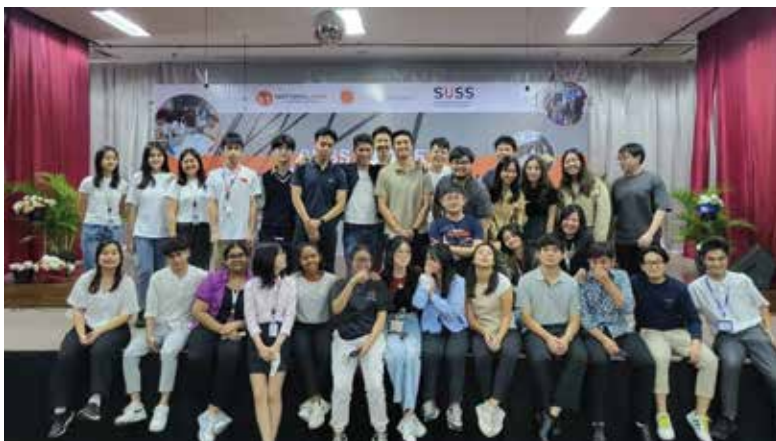
ALL PARTICIPANTS OF THE IMPACT START UP CHALLENGE 2023.