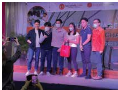
TEAM PEEACE – 2ND RUNNER UP