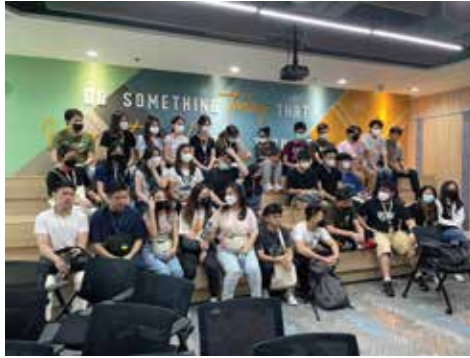
SITE VISIT AT PLUG N PLAY