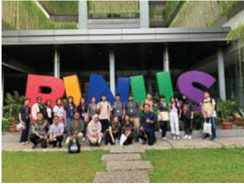
SITE VISIT AT BINUS UNIVERSITY