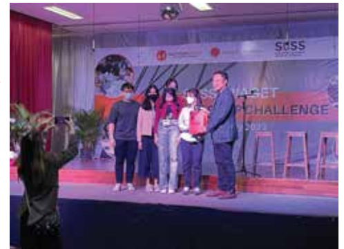
TEAM PEEACE – 2ND RUNNER UP