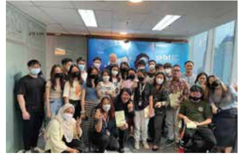
SITE VISIT AT ORBIT FUTURE ACADEMY