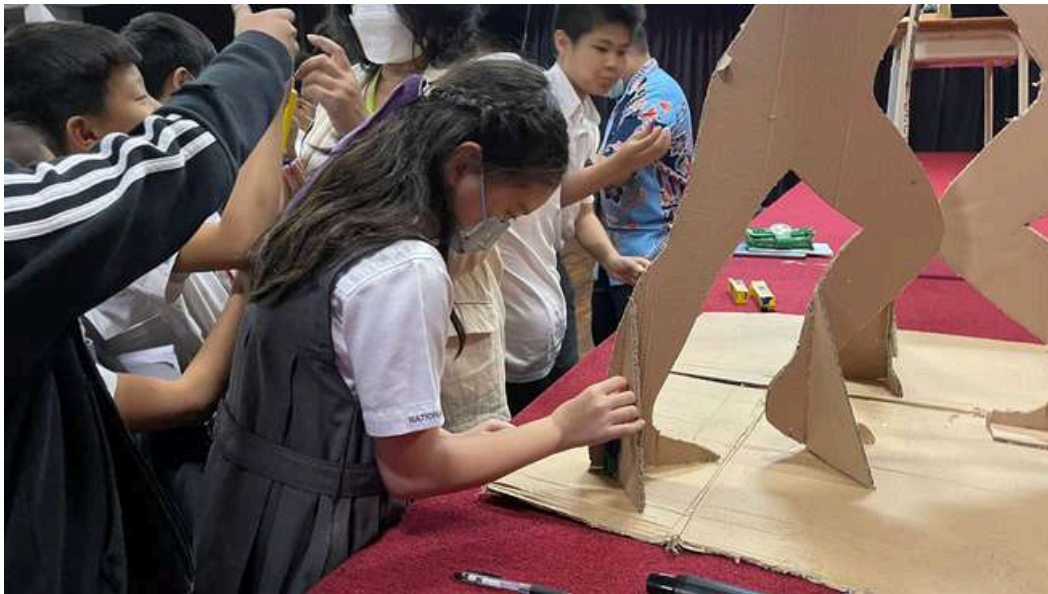
Years 5 - 6 Art Workshop for IPW 2023-2024

We look forward to a productive and inspiring IPW year and are excited to see the innovative and meaningful projects our students will undertake.