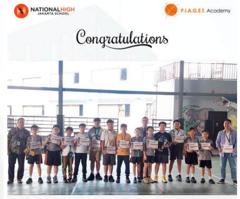
SPK Youth Basketball League