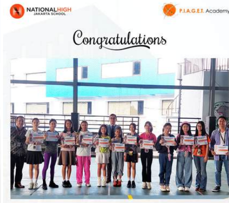
SPK Youth Basketball League