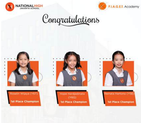
Kejuaraan Kota (KEJURKOT) Jakarta Barat 2025 Basketball KU12 Putri