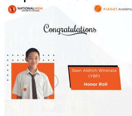
American Mathematics Competition 8 2025