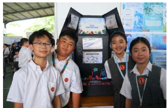
Y5-Y9 IPW Presenters During the IPW Fair 2025