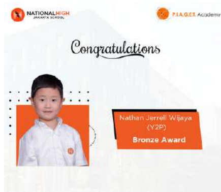
Global Mathematics Elite Competition (GMEC) - Mathematical Olympiad