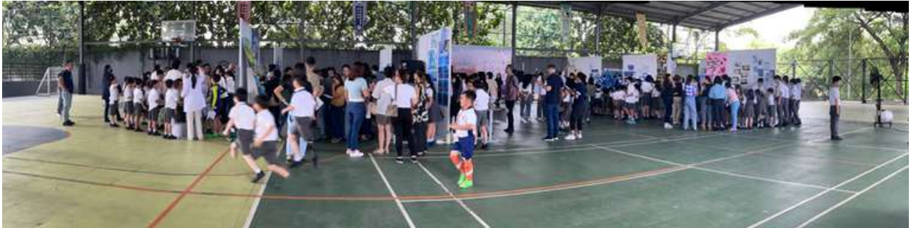
The NHJS Community enjoying IPW Fair 2025