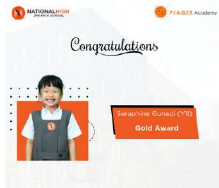
Global Mathematics Elite Competition (GMEC) - Mathematical Olympiad