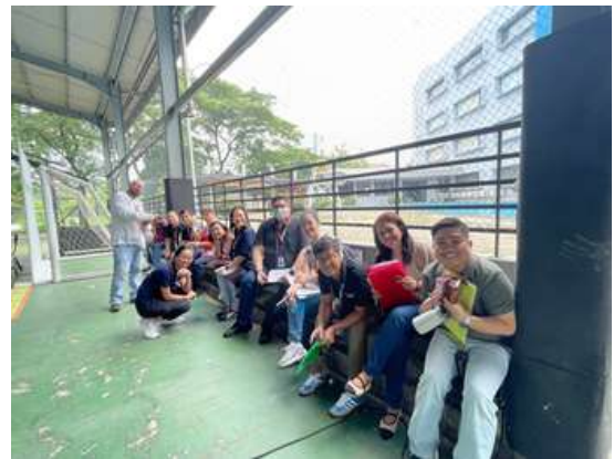
NHJS Teachers and IPW Judges