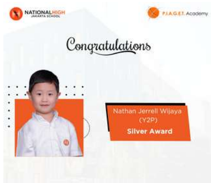
Global Mathematics Elite Competition (GMEC) - Mathematics