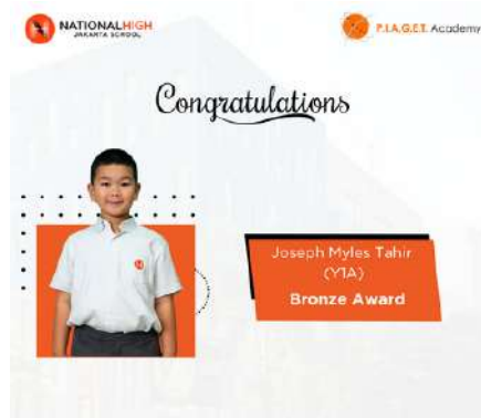
Global Mathematics Elite Competition (GMEC) - Mathematics