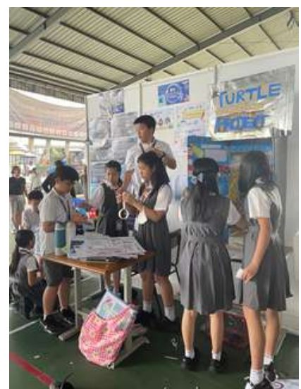
Primary School students set up their booth