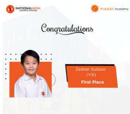
Beijing Invitational Open Contest