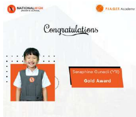
Global Mathematics Elite Competition (GMEC) - Mathematical Olympiad