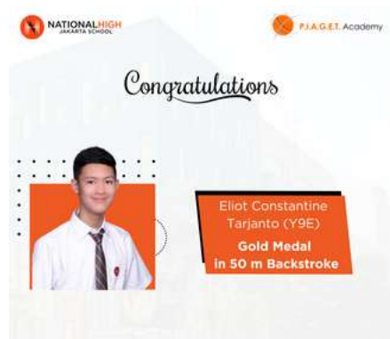
Dragon Dash Competition 2025